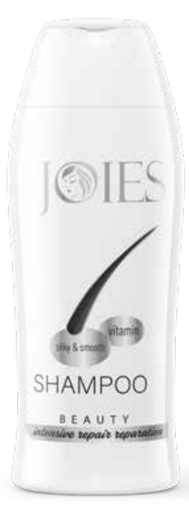
750 ml - 400 ml