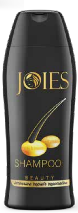
750 ml - 400 ml